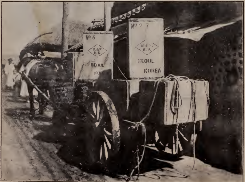
Scriptures Arriving at Bible House.

The second method is through book rooms or depots. With the co-operation of missionaries we opened in the capital, and towns of importance, shops for the sale of the Scriptures. These shops had a room adjoining where the books could be read and questions asked, and these